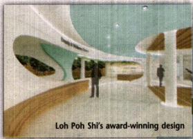
Loh Poh Shi's award-winning design