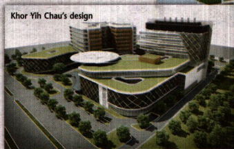
Khor Yih Chau's design