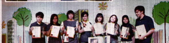
The winners of the Nippon Paint Young Designer Award 2010

B EAUTY and environmental consciousness were the focus at the recent Nippon Paint Young Designer Award 2010.