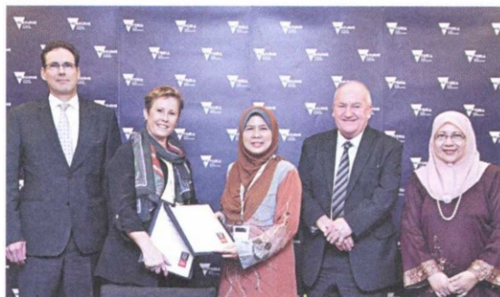
The MOU signing between Swinburne University of Technology and University of Malaya