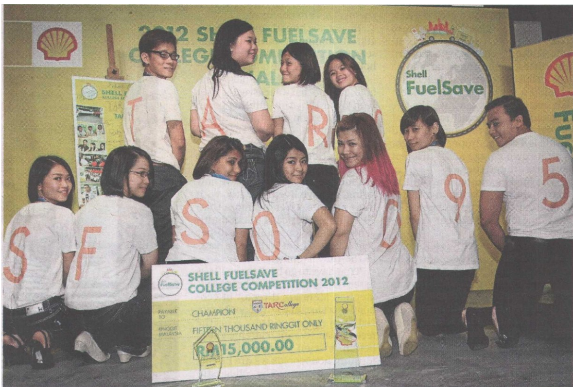
The winning team from Tunku Abdul Rahman College .