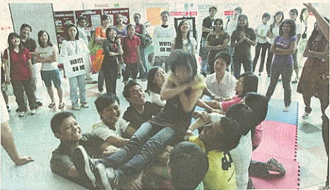
Participants of the Leap of Faith exercise