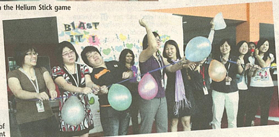
At the launch of the event